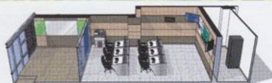
Network Operation Centre (NOC), NICTE, BCC